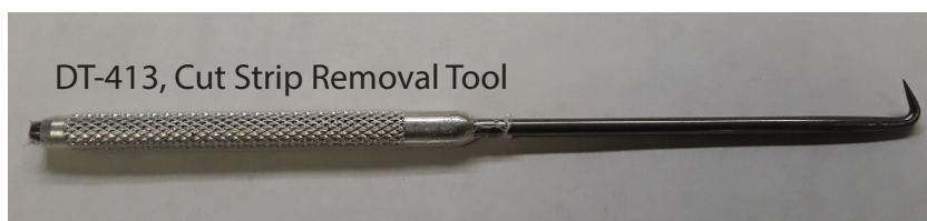
DT-413, Cut Strip Removal Tool

To remove the old cut strip, use Cut Strip Removal Tool DT-413 or similar to pry up the end of the strip.